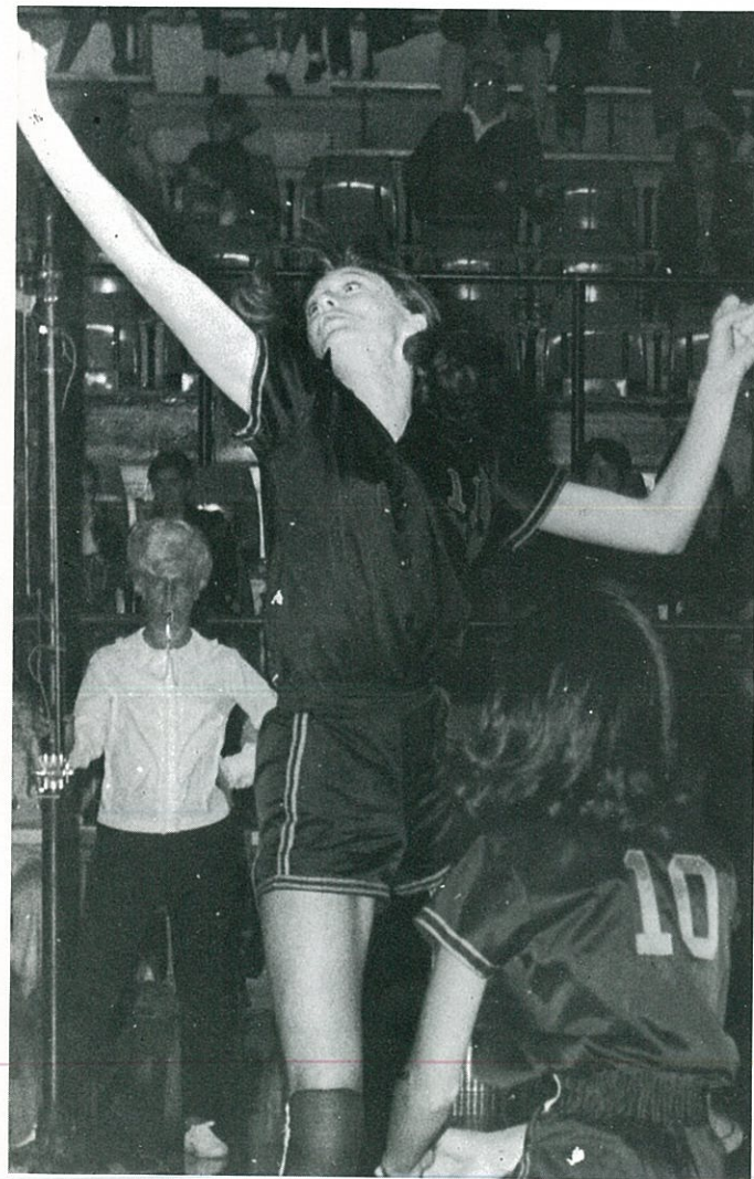
Reach for a star!